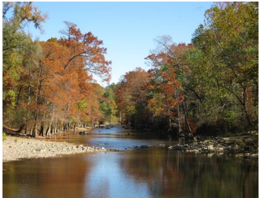
Mountain Fork River in McCurtain County.